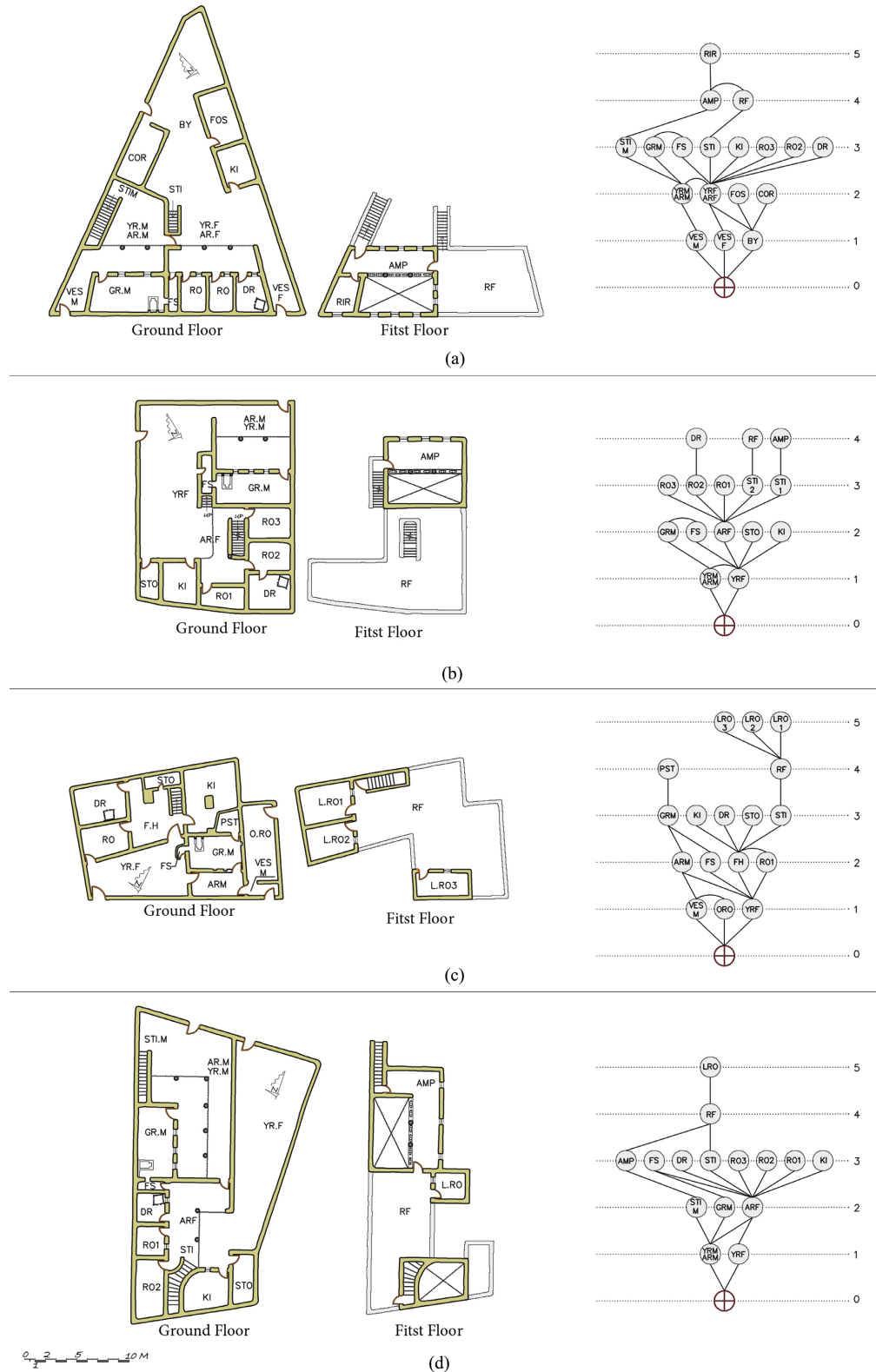
Figure 4. Plans and Justified plans graph for dwelling samples 1, 2, 3, and 4. (a) Plans for dwelling sample 1 and, Justified plan graph; (b) Plans for dwelling sample 2 and, Justified plan graph; (c) Plans for dwelling sample 3 and, Justified plan graph; (d) Plans for dwelling sample 4 and, Justified plan graph.