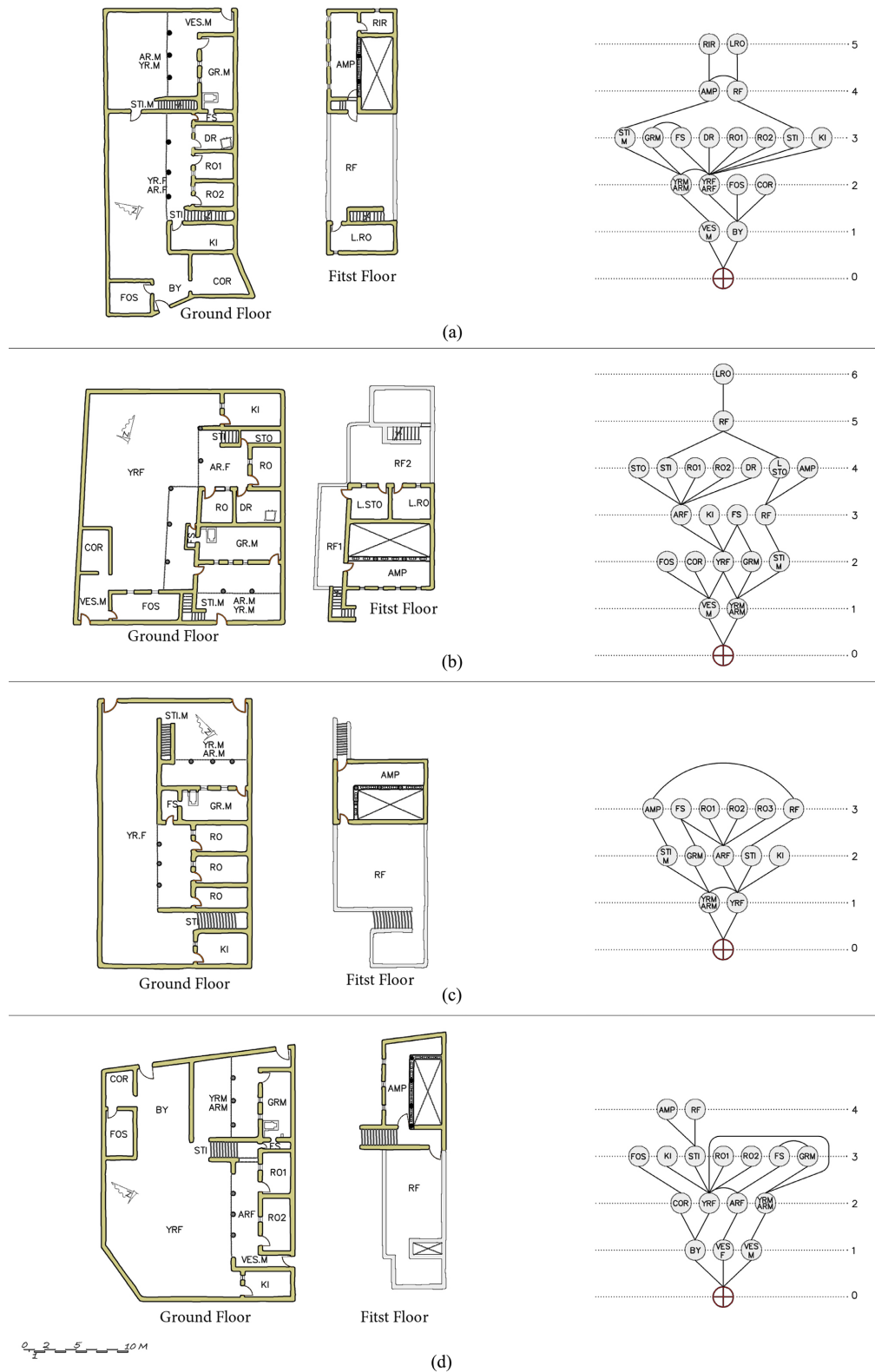
Figure 5. Plans and Justified plans graph for dwelling samples 5, 6, 7, and 8. Source: Author. (a) Plans for dwelling sample 5 and, Justified plan graph; (b) Plans for dwelling sample 6 and, Justified plan graph; (c) Plans for dwelling sample 7 and, Justified plan graph; (d) Plans for dwelling sample 8 and, Justified plan graph.