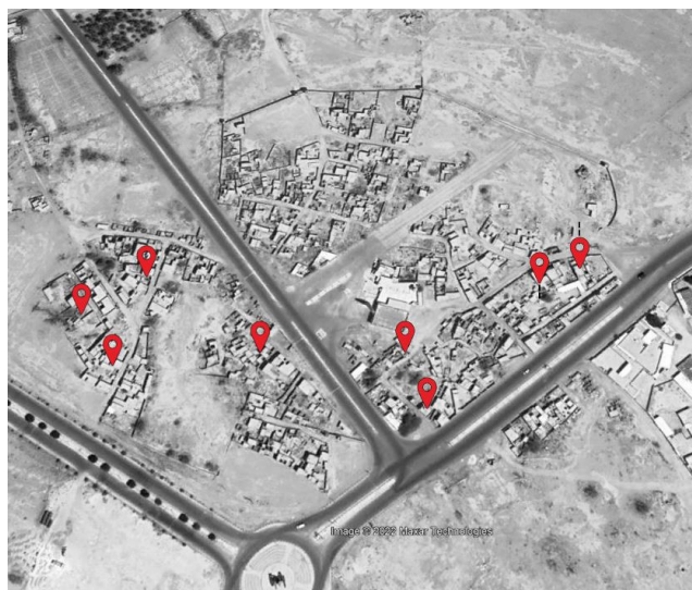
Figure 3. The Selected dwellings samples from Riyadh Al-Khabra's town.

The Riyadh Al Khabra governorate, located at the heart of the Al-Qassim province (Figure 3) is an ancient town, established at the end of the 12th century AH (1688-1785 CE) [24] [25]. The town is now considered one of the best examples of traditional housing in Saudi Arabia's central region because it includes a diverse range of traditional dwellings, and the town is more generally in decent shape, with many areas retaining multiple original traits. However, many houses in the town have recently deteriorated and been demolished due to a lack of conservation policies, triggering a more urgent need for the present research.