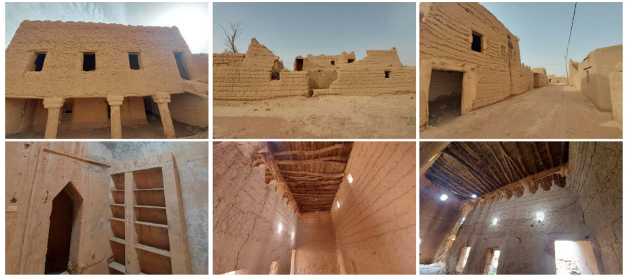
Figure 1. Dwellings examples from Riyadh Al-Khabra's town.

configuration of traditional dwellings in Riyadh Al-Khabra's town and its socio-cultural principles and values? In addition, how can the interior spatial constants and genotypes be identified?