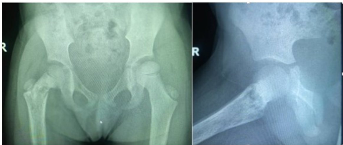
Figure 2. Additional radiological assessment.