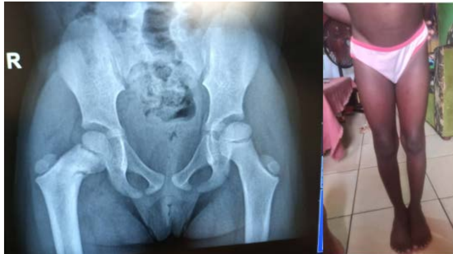
Figure 3. Radiological appearance and image of the patient in bipedal support after 10 weeks.