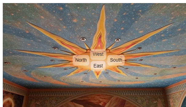
Figure 3. The symbol of the “Sun of the Year” from the ritual hall of the Trypillia Religion community (view to the east).