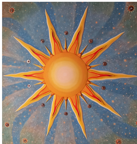
Figure 2. The symbol of the “Sun of the Year” from the ritual hall of the Trypillia Religion community (view from below).

Another important sacred symbol of the denomination is the “Sun of the Year”. For example, since 2000, in the main ritual hall of the “Religion of Trypillia” Spiritual Center, namely in its ceiling part, there has been a composition of the sun made up of ten equal parts of rays, from which a sun-fire Swarga seems to unfold ( Figure 2, Figure 3 ).