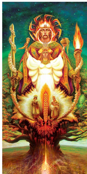
Figure 1. Fragment of the mural “Tree of Life” from the “Religion of Trypillia” Spiritual Center (artist V. Kryzhanivskyi, 2000, the size of the painting is 5 × 5 meters).

The main religious symbol of the “Religion of Trypillia” is the “Tree of Life”. It occupies a central position in the main ritual hall of the Spiritual Center, which is located in a country house near Kyiv (Ukraine) ( Figure 1 ).