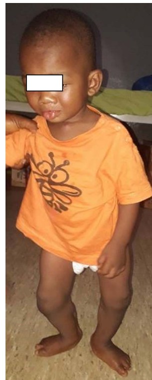
Figure 7. At walking age at 16 months.