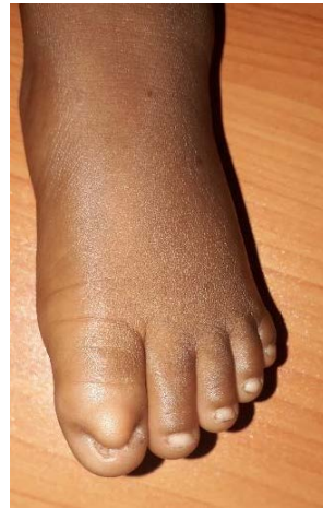
Figure 3. Triangular skin fold over the hallux.