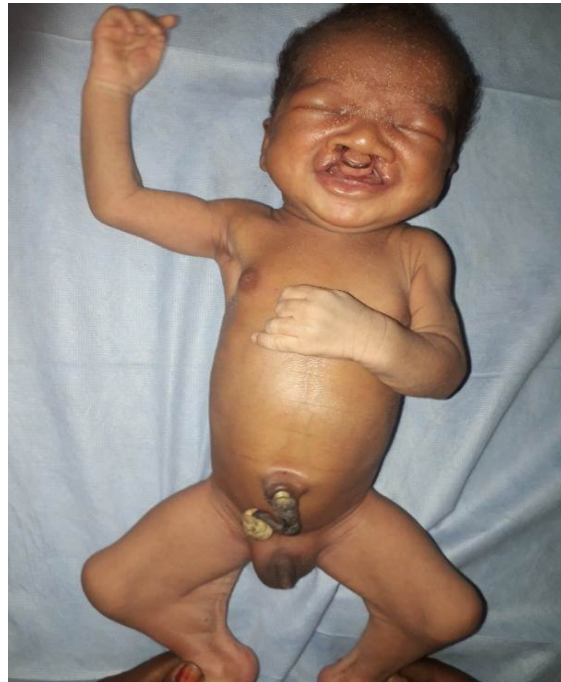
Figure 1. Bilateral cleft lip and palate and bilateral popliteal pterygium.