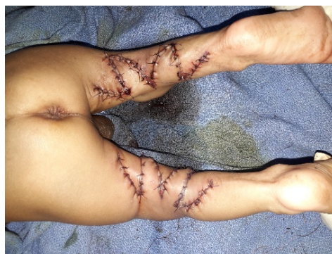
Figure 5. Z-shaped skin plasty in series.

Lower lip sinus excision is scheduled for the next admission. The patient walked at 16 months, the feet are plantigrade ( Figure 6 ), he began physiotherapy with the aim of correcting the residual 20° flexum in the right knee.