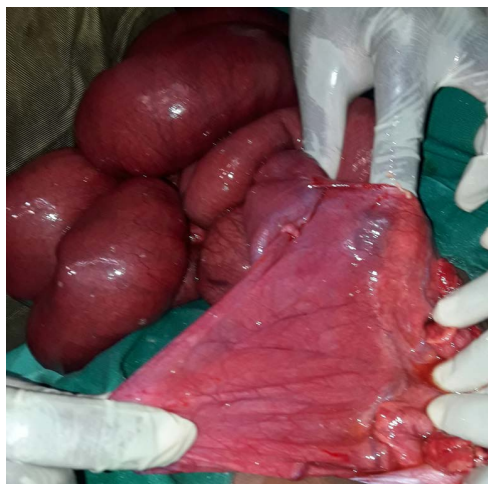
Figure 3. Retrocolic hernia sac with a collar of 11 cm and a deep of 18 cm.