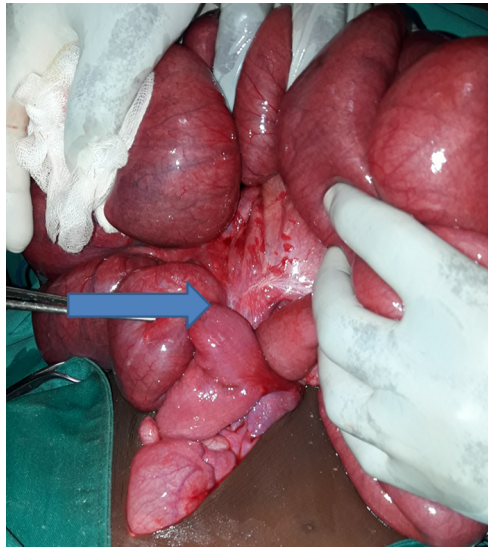
Figure 4. Perioperative image of small intestinal volvulus.

Due to the complex nature of the rotation of the gut and resorption of the mesentery, these recesses may enlarge or recede, and individual variations may lead to the development of different recesses in this area. Paraduodenal fossa originates as congenital peritoneal anomaly owing to failure of mesenteric fusion with the parietal peritoneum. There is also an associated abnormal rotation during imprisonment of the small intestine beneath the developing colon. These recesses, therefore, are regarded as congenital and have been considered clinically and surgically as sites for internal abdominal hernias [4]. Para duodenal hernia is the most common cause of internal hernia. It represents alone 53% of internal hernias and 75% of para-duodenal hernias [5]. The left mesenterico-parietal or paraduodenal hernia is the protrusion of the intra-abdominal viscera through the Landzert paraduodenal fossa [6]. According to some authors, they interest men three times more often than women [7] [8]. Our case was also discovered in a boy.