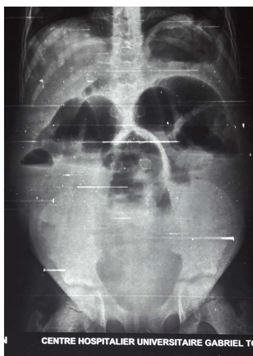
Figure 1. Plan abdominal radiograph showing hydroaeric levels with no air in the rectum.

A 5-year-old boy, admitted for sudden onset of abdominal pain associated with bilious vomiting, matters and gases cessation, lasting for 4 days before his admission. In his history, he was born at term with a birth weight of 2500 g, an apgar of 10. He had since the age of 6 months episodes of abdominal bloating, crying, profuse diarrhea and food vomiting. No diagnosis was made after several medical visits to the pediatrician. In admission he a growth retardation, a good conscience, well-colored conjunctiva, hemodynamic and respiratory stability, a body weight of 14 kg, a Z score of -2 , a temperature of 37.5^{\circ}\text{C} . His abdomen was distended, with a tympanism. The rectal ampoule was empty on digital rectal examination. A Plan abdominal radiograph revealed mixed-type hydro-aeric levels (small intestinal, colic) with absence of rectal air ( Figure 1 ). A biological assessment was carried out. The hemoglobin level was 12 g/dl, the hematocrit at 36, the white blood cells at 4000, the platelets at 150,000, the natremia at 120 mmol/L, the serum potassium at 2 mmol/L, the chloremia at 98 mmol/L and