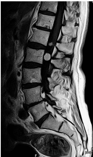
Figure 2. Lumbar T1-weighted sagittal MRI reveals 2 tumors, a large tumor and a smaller one at L2 level. The shapes are round and brightly enhanced by gadolinium. The other tiny tumor at the L5 level could not be seen in this image.

Iophendylate myelography via a lumbar puncture revealed complete obstruction at L1. He thus underwent resection of spinal cord tumors (diameters were 1.5, 1.0, and 0.8 cm). Pathological findings indicated that all 3 were neurinomas. Postoperatively, the patient scored 14 s and 20 steps on the 3 m timed up and go test (compared to 15 s and 24 steps preoperatively), HDS-R score improved to 28/30 and MMSE score remained stable at 28/30. Brain MRI taken 3 months postoperatively did not show any changes. Urinary incontinence disappeared completely, while abnormal sensations of the lower limbs persisted.