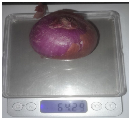
Figure 1. Measurement of onion bulb weight.

Data were collected from a sample of 25 bulbs per bed, corresponding to 75 bulbs per variety and a total of 225 bulbs for the three varieties. For each bed and each variety, bulb length, width, and weight were measured ( Figure 1 and Figure 2 ).