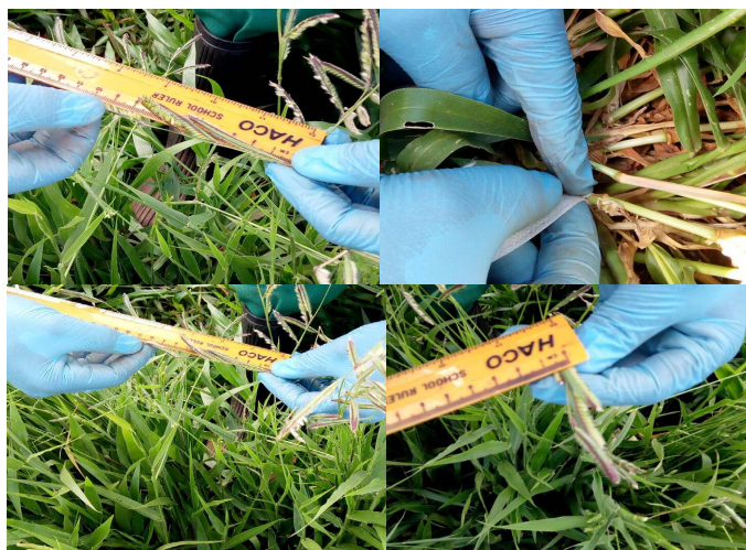
Figure 1. Measurements of flower width, length, raceme length and stem diameter.

The border rows were planted with basilisk (B). The plot was watered in the afternoons; and the data collected were plant height, Leaf length, leaf width, ligule length, date at 50% and 75% flowering, stem diameter, inflorescence length, width ... Treatments or samples were labeled (t) sample 1 to 16; the ones lacking are those which were removed ( Figure 1 ).