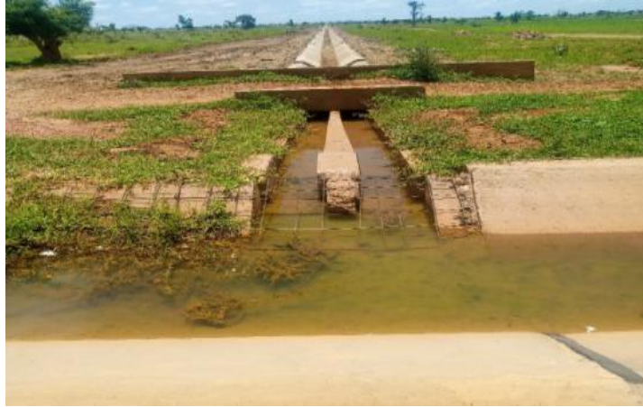
Figure 2. Very degraded secondary channels [8].

Plates in good condition concern plates 1m long. As soon as the length of the plates exceeds 2 m, cracks are apparent in the majority of the plates and the degradation of the plates intensifies. Photo 1 shows the condition of the secondary canals before the rehabilitation activities ( Figure 2 ).