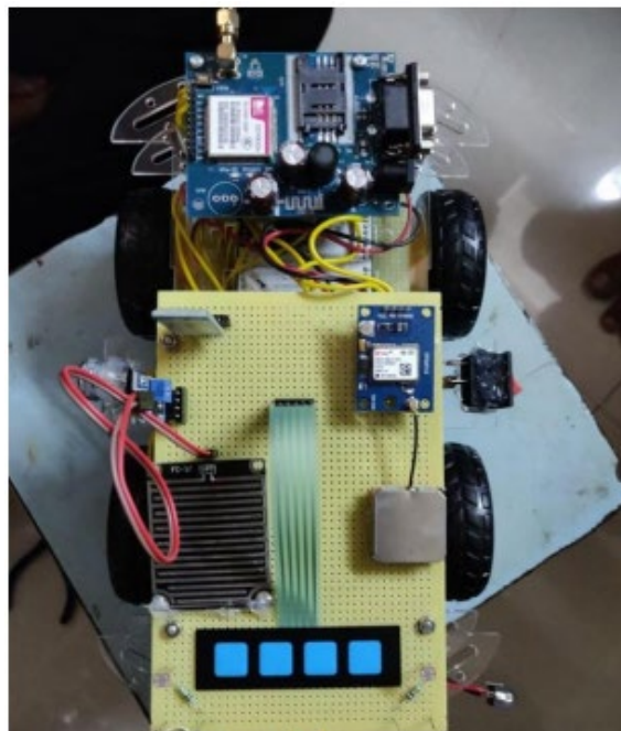
Figure 6. Prototype.