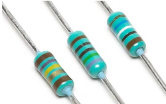
Figure 3. Resistors [5].

A resistor ( Figure 3 ) is a two-terminal passive electrical component that implements electrical resistance as a circuit element. In electronic circuits, resistors are used to reduce current flow, adjust signal levels, divide voltages, bias active elements, and terminate transmission lines, among other uses [5].