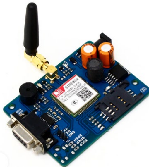
Figure 4. GSM module [6].

GSM (Global System for Mobile Communication) is used to transmit mobile data as well as voice services. GSM is an open, digital cellular technology used to transmit mobile and data services operating on the 850 MHz, 900 MHz, 1800 MHz and 1900 MHz frequency bands. It requires 12 V power supply. In this system, GSM ( Figure 4 ) is used in pothole detection application [6].