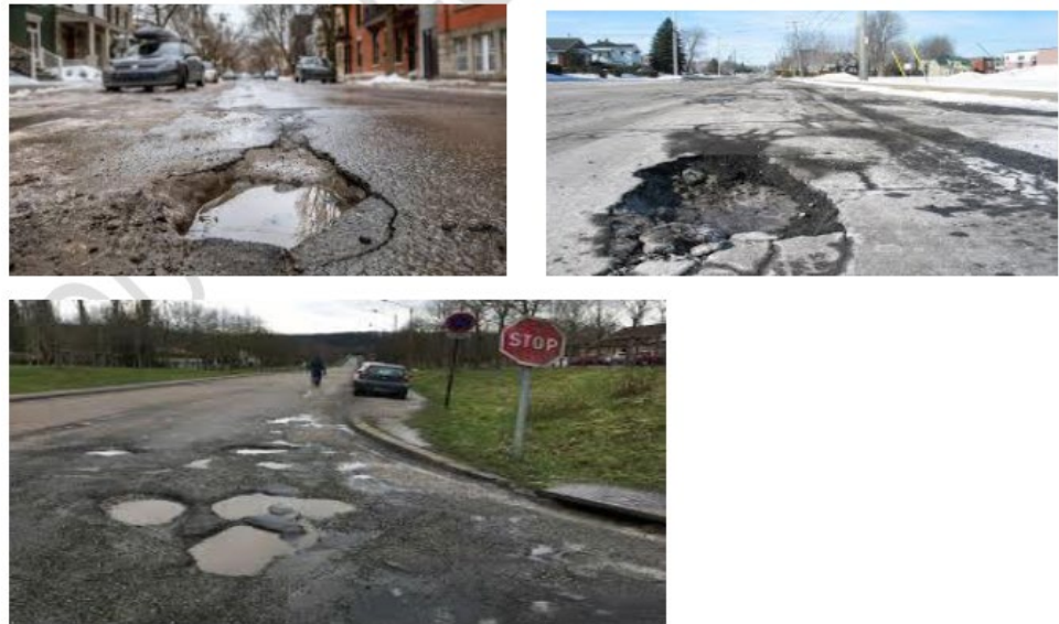
Figure 1. Pothole.

avoid accidents. To solve the above-mentioned problems, a cost-effective solution is needed that collects the information about the severity of potholes and speed bumps and also helps drivers drive safely. With the proposed system, an attempt has been made to encourage drivers to avoid accidents caused by potholes ( Figure 1 ).