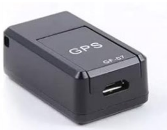
Figure 5. Module GPS [6].

can only receive vehicle location information from satellite when detecting potholes, and GPS (Figure 5) helps to trace the location of potholes [7].