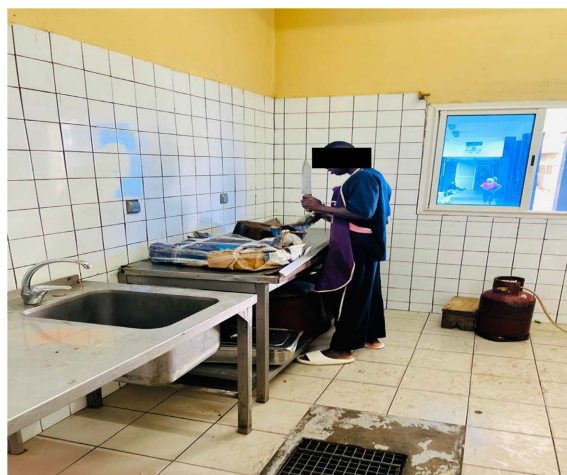
Figure 2. Cutting tasks performed without gloves and wearing inappropriate footwear.