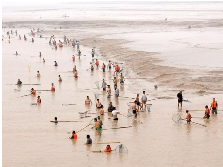
Figure 14. Net fishing on the Yellow River photo credit: initiativesrivers.org.

“Fishing remains an important activity (Figure 14), but catches have declined. In 2007, it was noted that 40% fewer fishes were caught in the Yellow River compared to earlier catches [40]. At times fishing is banned do to overfishing. Large cyprinids (Asian carp, predatory carp, Wuchang bream and Mongolian redbfin) and large catfish (Amur and Lanzhou catfish) are still present, but the largest species, the Chinese paddlefish, kaluga sturgeon and Yangtze sturgeon, have not been reported from the Yellow River basin in about 50 years [38] [39] [41]. Other species that support important fisheries include white Amur bream, ayu, mandarin fish, Protosalanx icefish, northern snakehead, Asian swamp eel and others” [39].