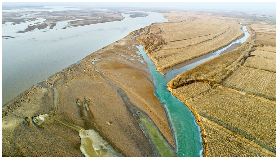
Figure 9. Fields along Yellow River with side channels [4].

dong and Henan provinces across the North China Plain. The plain is a nearly level, featureless, alluvial fan broken only by the low hills of central Shandong. It was formed over some 25 million years as the Yellow River and other rivers deposited enormous quantities of silt, sand, and gravel into the shallow sea that once covered the region [9]. The plain has been densely inhabited for millennia and has been one of China's principal agricultural regions (Figure 9). The river has changed its course across the plain several times. The region's inhabitants have built extensive systems of levees and irrigation works in an attempt to control the river's flow. The area illustrates perhaps better than any other place on Earth how human activity has combined with natural forces to shape the landscape.