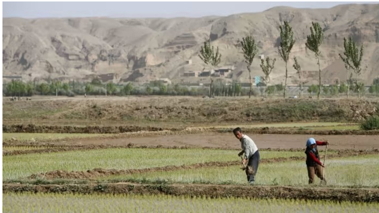
Figure 16. Workers in agricultural field [3].

of disaster in the development of Chinese civilization [49], and the management of Yellow River have been a great political trouble to various Chinese dynasties throughout the history since ancient time [50].