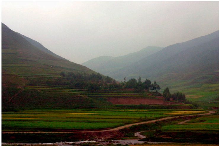
Figure 15. Agricultural fields along Yellow River [4].

On 25 November 2008, Tania Branigan of The Guardian filed a report “ China’s Mother River: the Yellow River ”, claiming that severe pollution has made one-third of China’s Yellow River unusable even for agricultural (Figures 15-17) or industrial use (Figure 18), due to factory discharges (Figure 19) and sewage (Figure 20) from fast-expanding cities [47]. After reaching the first major city, Xining, the river is heavily polluted.