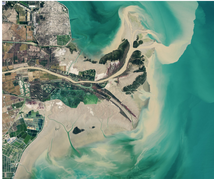
Figure 10. Yellow River delta.

into the Bo Hai (the remnant of the ancient sea now covered by the plain). In the century from 1870 to 1970 the delta grew an average of more than 19 km. Some outlying parts expanded even more rapidly: one area grew 10 km during the period 1949-1951, and another grew more than 24 km in 1949-1952. However, beginning in the 1950s, dam construction upstream—notably the Sanmen Gorge installation in Henan province—began to reduce the silt load that the river could carry to its mouth. By the 1990s, the delta was expanding seaward, but it was also eroding. The Chinese government subsequently took measures to divert the final part of the main stem, so that deposits built up on the north side of the delta.”