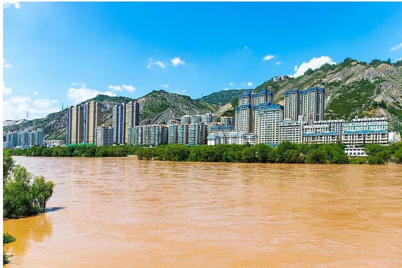
Figure 8. Lanzhou city on Yellow River [1].

river's width usually does not exceed 45 to 60 m in that section, as it cuts through narrow gorges with steep slopes above 100 m in height. The river then gradually widens, notably after receiving the waters of its two longest tributaries the Fen River of Shanxi province and the Wei River of Shaanxi. At the confluence with the Wei, the Yellow River turns sharply to the east for another 480 km as it flows through inaccessible gorges between the Zhongtiao and eastern Qin (Tsinling) mountains. The average fall in that stretch is slightly more than 20 cm per km and becomes increasingly rapid in the last 160 km before the river reaches the North China Plain at the city of Zhengzhou in Henan province.”