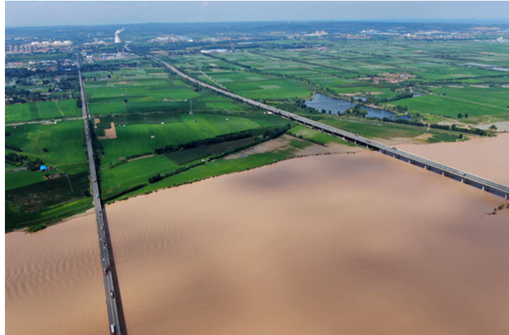
Figure 12. Map of the Yellow River crossings [9].

led to a major flood of the regional center Sizhou and Pan's dismissal from court. Subsequently, the river's 1680 flood entirely submerged Sizhou and the nearby Ming Zuling tombs beneath Hongze Lake for centuries until modern irrigation and flood control lowered the water level enough to permit their excavation and the tombs' restoration.