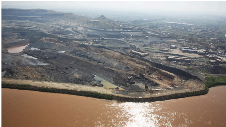
Figure 19. Coal mine and drainage into Yellow River through pipes [9].