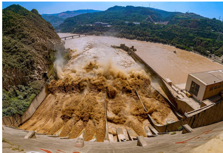
Figure 4. Discharge (spray) from Sanmexia Dam [4].

“The Yellow River’s middle reaches are about 1200 km long from Inner Mongolia to Zhengzhou, negotiating plains and hills on China’s Loess Plateau region, where huge amounts of sediment are eroded and suspended. In the Loess Plateau, the yellowest (the most sedimented) waterfall in the world is the Hukou (‘Kettle’s Mouth’) Waterfall. Sanjiangyuan (‘Three Rivers’ Origins’) Natural Reserve is in southern Qinghai. The three rivers are the Yellow River, the Yangtze River, and the Lancang River (which becomes the Mekong in SE Asia). It enjoys the moniker