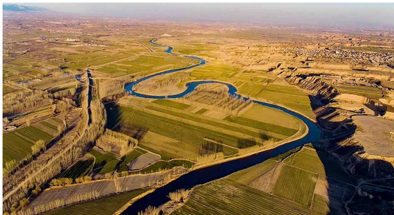
Figure 17. Agricultural lands on floodplain with escarpment [4].