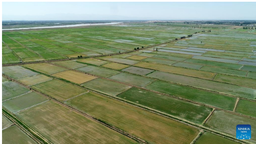
Figure 11. Ag lands and rice paddies [4].

“As the Chinese developed agriculture on the plain (Figure 11), they became more adept at building levees to stabilize the channel and protect the inhabitants against the floods brought by shifts in the channel. Tens of thousands of miles of levees have been constructed through the centuries. The overall effect of those structures has been to delay flooding. Because the riverbed has been elevated and confined artificially, levee breaching and channel shifts have become more dramatic and destructive than they otherwise would have been. The few hydraulic engineers who succeeded in decreasing rather than increasing the flood hazard have gained legendary status in Chinese history.”