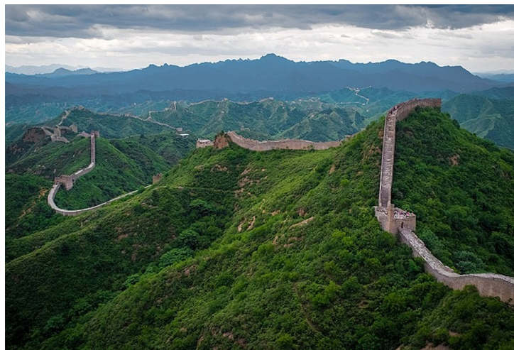
Figure 1. The Great Wall of China.

The Great Wall of China ( Figure 1 ) is a massive fortification that spans thousands of kilometers across the northern borders of China. It crosses several major rivers, including the Yellow River, Yalu River, and Wei River, and these rivers have played an important role in the history and culture of the region.