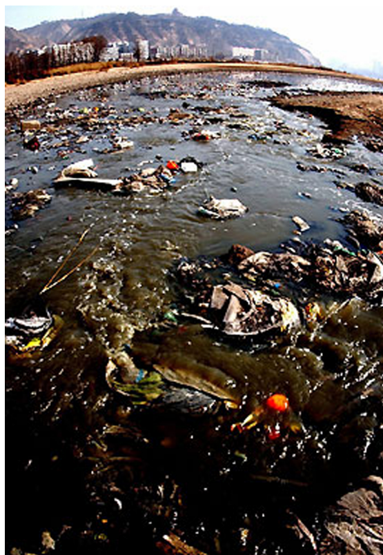
Figure 20. Trash in Yellow River [9].