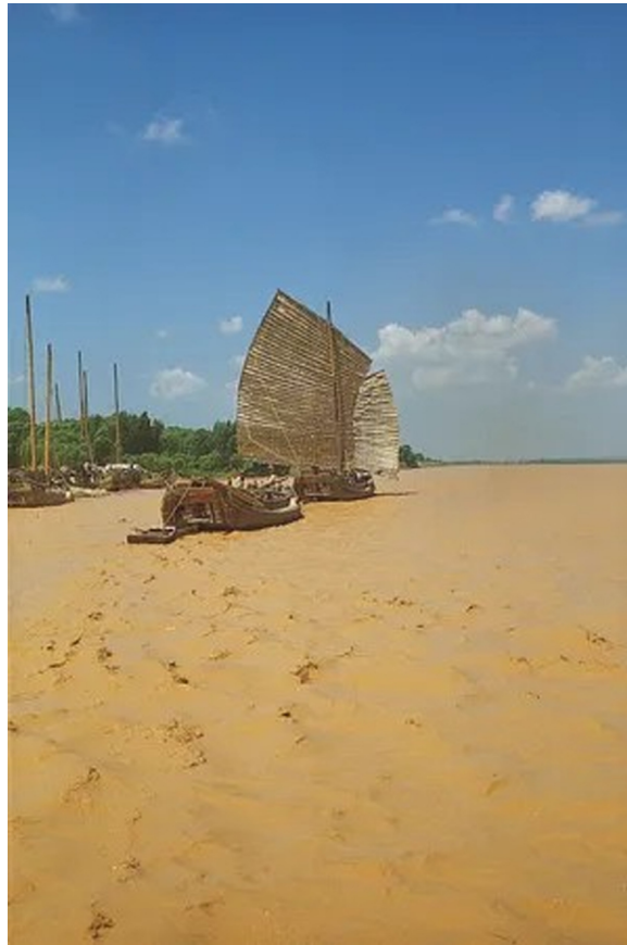
Figure 5. Boats on silted Yellow River [4].

‘China’s Water Tower’ and a richness of landscapes including mountains, glaciers, lakes, and valleys.”