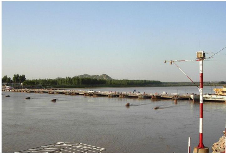
Figure 13. Pontoon bridge [9].