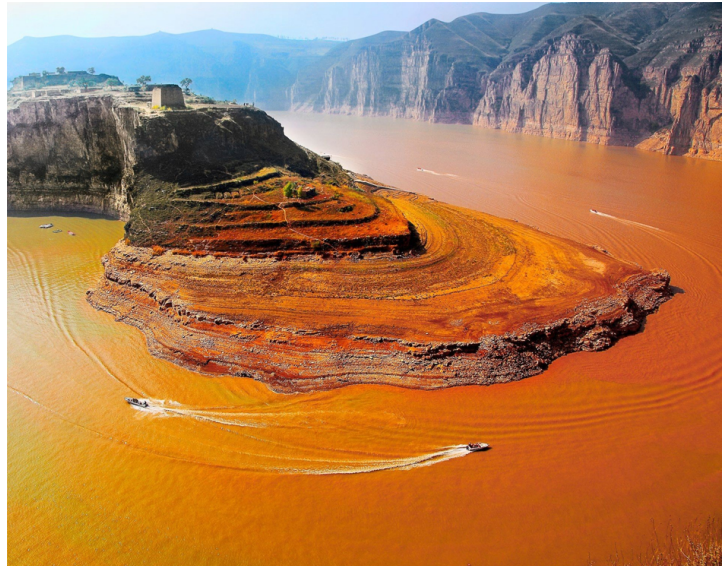
Figure 3. Yellow River bend in highlands. The river water is orange reflecting the sediment load [3].

River, turning its water yellow or orange. It can be said that this yellowing of the river is the cost of development from a hunter-gatherer civilization to a farming civilization with a growing population. The Yellow River carries an average of 1.6 billion tons of sediment annually.”