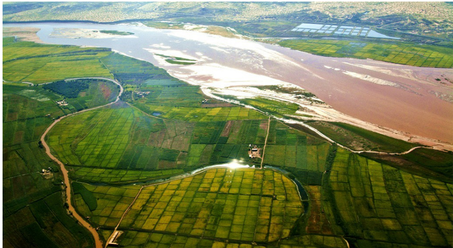
Figure 7. Yellow river with agricultural fields and levees. The river is filled with sediments [4].

tains, in the eastern Qinghai-Xizang Plateau ( Figure 7 ). In its upper reaches, the river crosses two bodies of water, Lakes Ngoring and Gyaring. Those shallow lakes, which freeze over in the winter, are rich in fish and cover an area of about 2000 square km. The Yellow River in that region flows generally from west to east. The broad highlands of the upper course rise 300 to 500 m above the river and its tributary floodplains. The highlands consist of crystalline rocks occasionally visible as eroded outcroppings on the surface. The river enters a region of deep gorges, winding its way first southeast, then northwest around the A'nyêmaqên (Amne Machin) Mountains, where its fall exceeds 2 m per km, and then east between the Xiqing and Laji mountains. Once past the gorges, it leaves the Qinghai-Xizang Plateau near the city of Lanzhou ( Figure 8 ) in southeastern Gansu province. That transition marks the end of the upper Yellow River, some 1165 km from its source. The upper course drains a basin covering about 124,000 km 2 . The upper river course consists chiefly of inaccessible, highly mountainous, sparsely populated terrain with a cold climate.