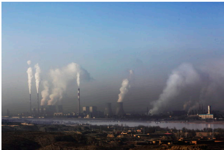
Figure 18. Industrial skyline with pollution in Yellow River [9].