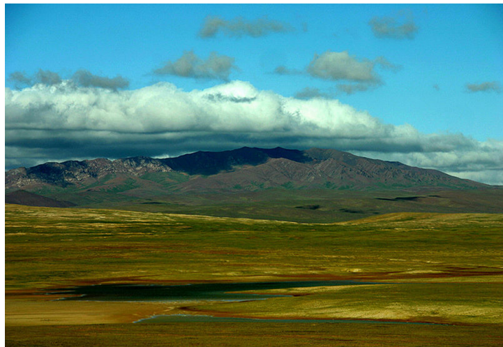
Figure 2. Qinghai-Xizang Plateau [3].

The Yellow River (Huang He in Mandarin or Huang Ho in defunct Wade-Giles or Hwang Ho) is the second longest river in China (after the Yangtze), and the fifth longest in the world [11]. The Yellow River originates on the Qinghai-Xizang Plateau (Figure 2) and flows through nine provinces from west to east, flowing into the Bohai Sea. It is the “mother river of China”: its basin was the center of Chinese politics, economy, and culture for over 2000 years.