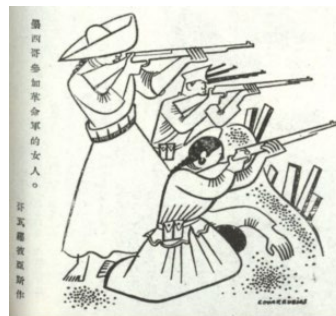
Figure 9. Miguel Covarrubias, Mexican Women in the Revolutionary Army, Modern Sketch , No. 2, February 20, 1934.