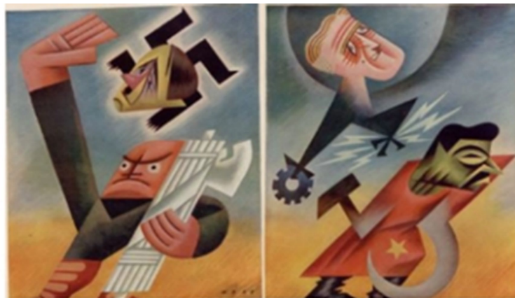
Figure 10. Zhang Guangyu, The Four Heavenly Kings, Wan Xiang , No. 1, 1934.

integration of national characteristics and Art Deco geometric patterns. In 1934, Zhang Guangyu published The Four Heavenly Kings (1934) ( Figure 10 ) in Panorama , among which two works—Mussolini, the Italian King of Fascist Remonstrance; Hitler, the German Swastika King and Stalin, the Soviet Iron-Arm King; Roosevelt, the American Blue Eagle King—hardly adopted traditional Chinese decorative elements, but continued to use geometric patterns, cleverly applying collage and Cubist styles. It can be seen that his comic creation did not simply adopt the Art Deco style but integrated a variety of stylistic techniques to enhance the decorative effect of the picture. Zhang Guangyu did not fully inherit the aesthetic spirit of Art Deco, but responded to the modern Art Deco aesthetics that