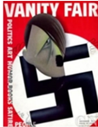
Figure 3. Paolo Garretto, Adolf Hitler, Vanity Fair , November 1932.

of works for various clients and started his “international artistic adventure”. He used techniques such as superimposition and collage to shape figurative characters with a deliberate sense of form, reshaping the modern spirit of the Art Deco style (Cai, 2014). The 1925 Exposition Internationale des Arts Décoratifs et Industriels Modernes in France showcased the artistic achievements of French Art Deco. Influenced by this, the insight and ideological depth contained in Garretto’s works were unparalleled by other cartoonists of the same period. The mechanical geometric beauty advocated by Art Deco was not only influenced by and echoed the contemporary modernist design, but also absorbed nutrients from artistic trends such as Cubism, Structuralism, and Futurism (La Vie, 2013).