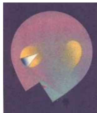
Figure 2. Paolo Garretto “Gabriele D’Annunzio”, The Graphic , 1927.