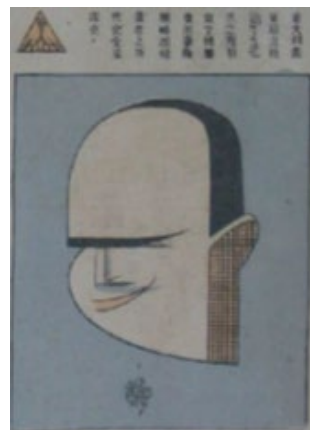
Figure 4. Paolo Garretto, Douglas Fairbanks, Shanghai Cartoon , No. 3, May 5, 1928.

It is worth noting that in 1928, Shanghai Manhua published Garretto’s works (Figure 4, Figure 5) (1928a, 1928b). These works shared themes with local Chinese satirical comics but, due to the limitations of China’s printing and publishing technology at the time, their presentation had to adapt to Chinese-style lines and coloring, while still retaining the unique flat geometric decorative texture of Art Deco. After the 1950s, Garretto’s works gradually faded from public view; in 1983, Condé Nast Group revived Vanity Fair , attempting to replicate its early fashion style, but failing to reproduce the insight and ideological depth of Garretto’s