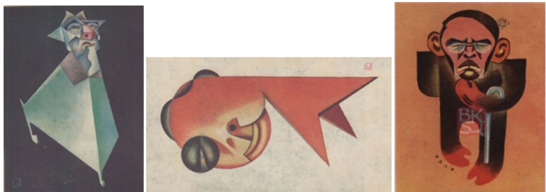
Figure 6. Zhang Guangyu, Ideology , Portraits of Lin Sen, Sun Ke and Chen Youren, The Modern Age , Vol. 2, No. 10, July 16, 1932.

Zhang Guangyu occupied a pivotal position in the history of Chinese comics, having been active in satirical comics for a long time. His work was always committed to exploring diverse artistic styles and to exposing all aspects of society with sharp brushwork. The new look of his satirical paintings was concentratedly reflected in the decorative and interesting style that combined content with public opinion—abandoning the previous expression method of metaphor through popular sayings, the picture design no longer relied on simple line drawing for detailed depiction, but tried to outline the outline with simple geometric shapes, and the colors adopted a light dyeing transition technique, presenting a distinct pattern decorative interest as a whole, which was relatively rare in satirical painting creation at that time. In 1932, Zhang Guangyu published Ideology (1932) in Time , Volume 2, Issue 10 (Figure 6, Figure 7), integrating mechanical aesthetics into the decorative style, with lines tending to be more geometric, emphasizing a sense of symmetry and neatness, and the pyramid-shaped step composition forming a strong visual impact and unique sense of rhythm. The seemingly complex patterns in the Art Deco decorative style are all based on lines and geometric