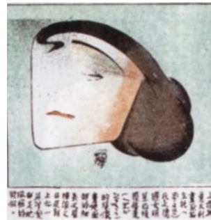
Figure 5. Paolo Garretto, Pola Negri, Shanghai Cartoon , No. 17, August 11, 1928.

works, nor could it endow the publication with nostalgic artistic value. The core reason Garretto's decorative works entered the vision of Chinese cartoonists lies in their popular and avant-garde creative characteristics, which closely aligned with the trend of the times and social issues, providing an important opportunity for the exchange and collision between Chinese and Western comics.