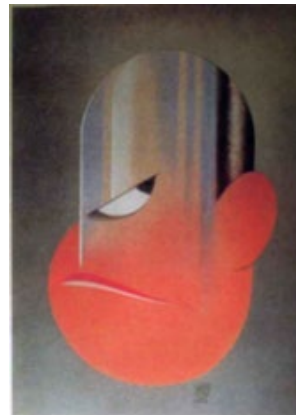
Figure 1. Paolo Garretto, “Benito Mussolini”, The Graphic , 1926.

Italian artist Paolo Garretto (1903-1989) was a world-renowned cartoonist in the 1920s and late 1930s, as well as a creative master of advertising design and editorial art. His works were published in major American magazines, including Time , Vogue , and The New Yorker . As one of the core creators of Vanity Fair , he used airbrushed comics to embody the Art Deco decorative style, capturing the romantic temperament of the industrial age through distinct geometric designs ( Figures 1-3 ). In 1925, Garretto began creating comics for Roman newspapers and satirical magazines, and later moved to Paris, where he created hundreds