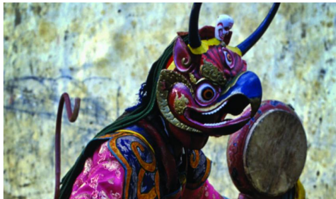
Figure 6. Safeguarding at multicultural carnival reflecting the traditional beliefs and cultural diversity.

According to the rule followed in theoretical approaches of descriptive data, a sample of individual identity of focus group such Mir. Meor Amirul Din Bin Aris confirms that “an individual’s personality is emphasized from through designing and managing culturally their lifestyle” (Grudin, 1990). This meets with what many of researchers stated that individuals typically are reflected through their handmade artefacts as positive image of themselves, and this would give the impression of affiliation and unite an individual in their small community into another single group of the such community (Wiessner, 1983). Therefore, in such sense, stylistic similarity observed within group interviewers indicate that presence traits of similarities or converges are more important in order to reflect the social and cultural boundaries and the intellectual differences (Wobst, 1977).