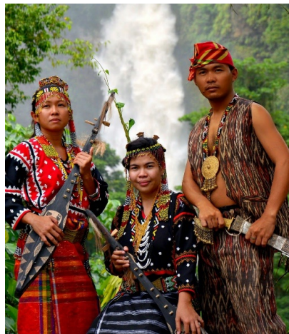
Figure 4. The T'boli women are holding the plucked lute, Philippine.