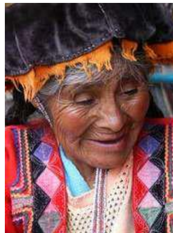
Figure 3. A tribal woman with traditional cloth from Malaysia, Ipoh.

linkages between an individual's development and the social-material conditions of his or her everyday practice e.g. (Chaiklin, 2001; Engeström, 1999) in second language research (Lantolf, 2000; Swain & Lapkin, 2000; Thorne, 2000). Higher order cognitive functions, including intentional memory, planning, voluntary attention, interpretive strategies, and forms of logic and rationality, develop out of participation in social practices such as schooling, interaction with care givers, the learning and use of semiotic systems such as spoken languages, textual and digital literacies, visual arts, music, exposure to folk and traditionally “cognitive norms” concepts (Figure 3), context-contingent behavioural norms, and spatial fields such as the social and functional divisions of built structures and visual artistic expression. All of these (and this is but a partial list) are uniquely human social-semiotic systems e.g. (Halliday, 1995) that evolve over time and continue to transform from generation to generation. To put this into modern parlance, (Vygotsky, 1978, 1986) argued that situated social interaction connected to practical activity in the material world is the source of the development of culture (Figure 4). In turn, cultural-societal structures provide affordances and constraints