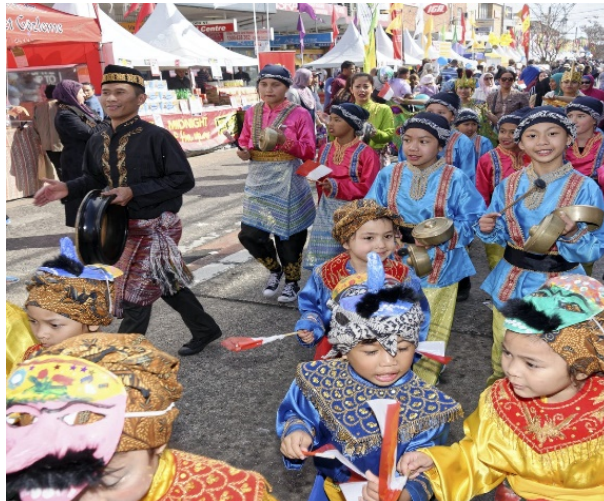
Figure 7. Multiculturalism shows the cultural diversity in one society of Asian countries.

drawn to study various issues of cross-cultural issues and numerous aspects manifold that contain generally folk cultures' need, people cultural preferences, and marketing rules (Aronson, Skibo, & Stark, 1994). Nevertheless, during pursuing some of impactful cultural activities it was evident that some of cross-cultural producers are motivated to make various culturally feedback based on different types of cultural effective preference; as well in some other types of cultural differentiation we can observe the differences among people maintaining of own culture from the perspective of social and ethnic identities (Arnold & Nieves, 1992). In other side, in what regard to the cultural distinctively receivers, it is need to be undergone with closer analyses research investigates the factors that might affect them as well (Bourges, 1996).