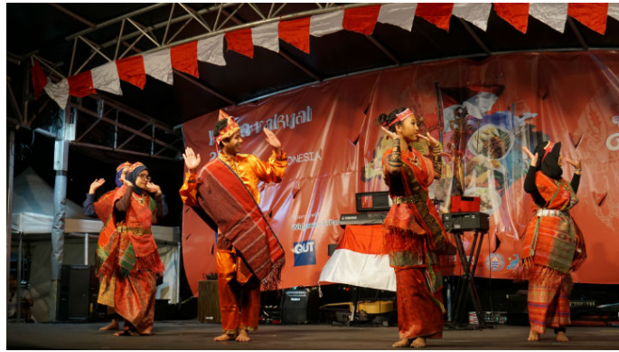
Figure 5. Traditional dance shows Indonesian culture and folk arts.