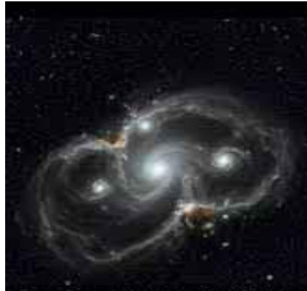
Figure 2. Vortices formed in a cloud of water vapor floating around a black hole [27].

Also, a planetary magnetic field could contribute similarly to the forming of cosmic dust rings, in our opinion.