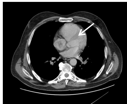
Figure 3. Same CT scan as presented above (November/2018) showing also an intracardiac thrombus.

This case exemplifies a very unusual presentation of a gastric cancer. Usually, cutaneous metastasis originate from the lung, breast, colon, melanoma, renal or head and neck cancer [10] [11]. It is known that spread of cancer, regardless of their origin, to a metastatic setting such as the skin, necessarily needs a hematogenous or lymphatic mechanism [11] but the rule is that the malignancy spreads in a stepwise manner, firstly from local metastasis and thereafter to a distant location [12]. This report case, besides representing a rare location of a metastatic site from a gastric cancer, is also peculiar since it was the only one single metastatic lesion at presentation, explaining why the patient was only lightly symptomatic. This reinforces the idea that accessible lesions such as skin