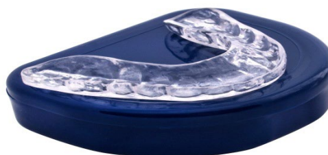
Figure 3. General night guard used to protect people from grinding related damage [20].

guards. After six months, the custom-fit group showed a significant reduction in tooth abrasion and TMJ pain, confirmed by tooth surface scans and patient-reported outcomes (Figure 3).