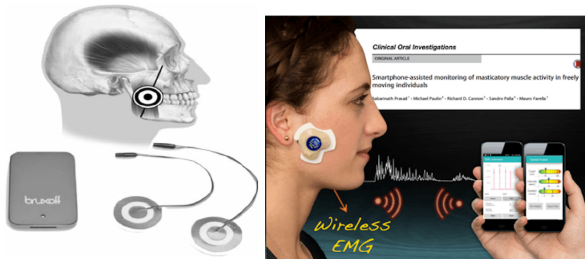
Figure 2. wireless electromyographic (EMG) device that patients wear on their jaws. The system was created by an international team of researchers, who detailed their development process and pilot study findings in Clinical Oral Investigations (January 4, 2019) [14].

Future advancements in these devices could include the integration of artificial intelligence to enhance pattern recognition, reduce false positives, and offer even