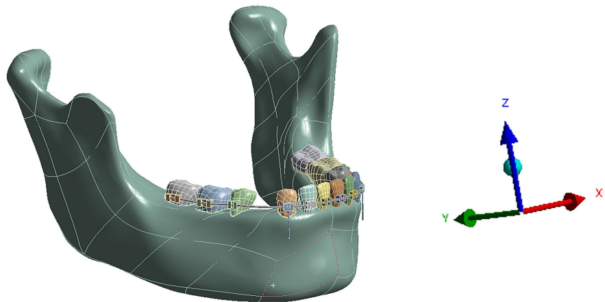
Figure 1. Three-dimensional finite element overall model for orthodontic biomechanical analysis (mandible including brackets and archwires-periodontal ligament-dentition-brackets-archwires).

(Dassault, France) and saved in PART format. Using Geomagic Design X, a periodontal ligament model was generated by uniformly extending 0.25 mm along the normal direction of the root surface. In SolidWorks 2022, simplified bracket models with and without traction hooks, as well as archwire models (bracket slot size 0.56 \times 0.71 mm, archwire size 0.43 \text{ mm} \times 0.64 mm [9]), were created. After reconstructing and solidifying the 3D models, they were assembled into a composite structure including the mandible, periodontal ligament, dentition, brackets, and archwire. Finally, the model was imported into ANSYS Workbench 22.0 R1 (ANSYS, USA) for meshing. The final model contained 38 components: one mandible, 12 periodontal ligaments, 12 teeth, two traction hook brackets, ten additional brackets, and one archwire ( Figure 1 ).