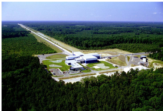
Figure 2. LIGO observatory.

events that simultaneously produce gravitational waves and neutrinos. By simultaneously detecting these two messengers, scientists can gain a more comprehensive understanding of the internal physical processes of supernova explosions, including the dynamics of core collapse and the formation of neutron stars. Furthermore, some hypothetical violent cosmic events, such as gamma-ray bursts or jets from active galactic nuclei, may also simultaneously produce detectable gravitational waves and high-energy neutrinos. This multi-messenger observation provides a unique opportunity to study these high-energy astrophysical processes. Although there are currently no confirmed joint gravitational wave-neutrino detection events, with the continuous improvement in detector sensitivity, such breakthrough discoveries may be realized soon.