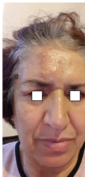
Figure 1. Initial presentation (April 14, 2020): Vesicular rash localized to the right forehead.

A 60-year-old woman presented to our ENT clinic with acute right forehead pain and a vesicular rash. She had a history of childhood chickenpox but no herpes zoster vaccination. The patient denied smoking, alcohol use, or regular medication intake. Her medical history was unremarkable, with no evidence of autoimmune, hematologic, or chronic systemic disorders such as diabetes mellitus or malignancy. She had no history of immunosuppression and was not taking any immunosuppressive therapy. Family history was non-contributory. She reported no recent travel, trauma, or known exposure to COVID-19. However, she experienced transient fatigue and mild dyspnea approximately one month earlier, which resolved spontaneously and was presumed to be a mild COVID-19-like illness. On examination, grouped vesicles were noted on the right forehead, upper eyelid, and nasal bridge (midline spared; Figure 1 ), with mild eyelid swelling and conjunctival injection ( Figure 2 ). No corneal haze, Hutchinson's sign, or visual deficits were observed. Nasal endoscopy revealed no sinus purulence.