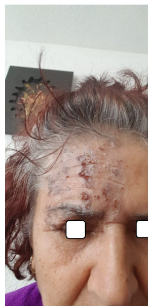
Figure 3. Clinical improvement (April 23, 2020): Day 9 follow-up showing crusting of vesicles and reduced periorbital edema.

By day 7, the rash began crusting ( Figure 3 ). Complete resolution occurred within four weeks ( Figure 4 ). At five-year follow-up, the patient had no residual scarring, neuralgia, or ocular complications ( Figure 5 ).