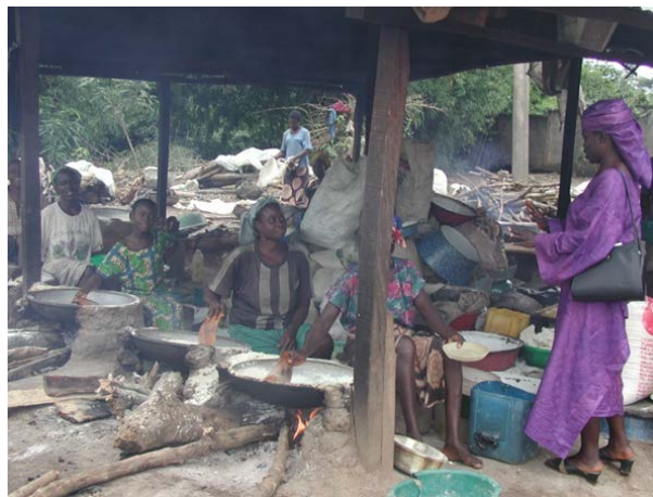
Figure 2. Sample of Women who stayed in the cooking area for more than 6 hours.