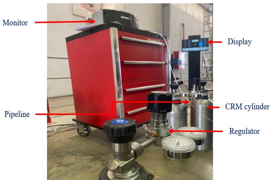
Figure 1. Calibration of CO/CO 2 monitors using CRMs.

the nitrogen gas cylinder to it using a regulator and a plastic pipeline to establish the zero background. When the zero-reading appeared and remained stable for one minute, the nitrogen cylinder was disconnected and the first CO or CO 2 CRM cylinder was connected to the monitor at the safe pressure specified in the manual. The CO or CO 2 mole fraction was measured five times, taking one measurement per minute, and the calibration results were recorded. Once finished with the first cylinder, it was disconnected and we proceeded to the next one until the five CRM cylinders were measured (see Figure 1 ). The response of the monitors in % was converted to \mu\text{mol/mol} (ppm) in order to interpret the results in terms of SI units.