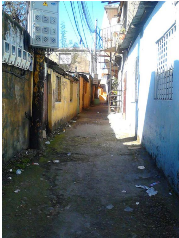
Figure 11. Side street in Cristo Rey, Santo Domingo. Consolidated settlement from the 1960s: On the Cusp of Slumification?

one can readily imagine that Cristo Rey could become the city's largest slum (Figure 11).