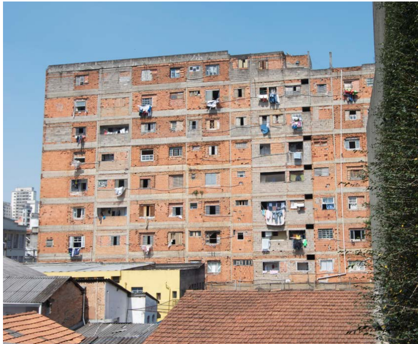
Figure 7. Cortiços (tenement rental housing), São Paulo. (Photo courtesy of Dr. Kristine Stiphany).

unplanned. According to Jiménez and Camargo (2015), within consolidated settlements, the living conditions of owners are better than renters in both Guadalajara and Bogotá. These authors also highlight that, in the absence of appropriate policies, densification manifests itself as overcrowding, particularly in rental housing. While both densification and renting can be considered natural processes in the life of an informal settlement, they can also increase overcrowding and deterioration in the absence of appropriate policies (Ward, 2015b). Indeed, the quality of rental housing in informal settlements may be poor from the onset, as landlords are less incentivized to consolidate rental units. Where rent control legislation exists, landlords are disincentivized from making improvements since they do not expect increased income (Baqai & Ward, 2020). Renters also may have little incentive to improve their housing conditions because it does not lead to asset building. Unless the challenges associated with landlordism and the lack of incentives for renters to consolidate are prioritized, renting may continue to lead to housing deterioration and slumification over time (Ward, Jiménez, & Di Virgilio, 2015a; Gilbert, 2003).