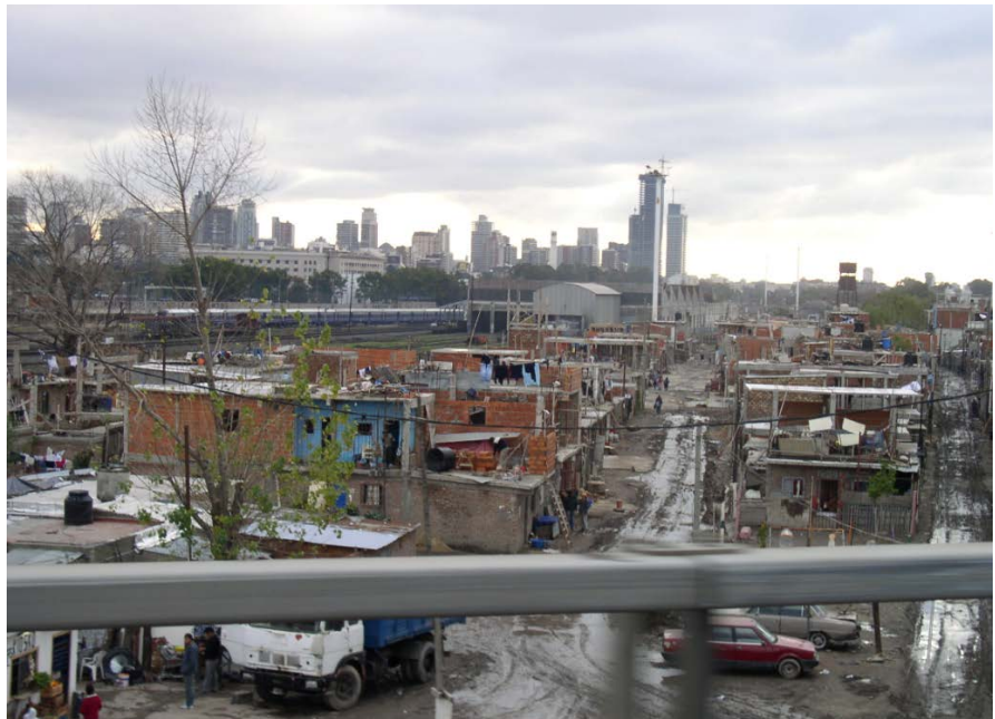
Figure 4. Villa 21, Center of Buenos Aires.

habitation either because of environmental issues or safety concerns. Nevertheless, residents may illegally occupy or squat on the land because of the availability and proximity to employment opportunities. These settlements are often along ravines and creeks and in areas prone to flooding with severe environmental concerns. Additionally, they can often be located in areas that are unsafe such as along railway lines. Los Platanitos in Santo Domingo Norte in the Dominican