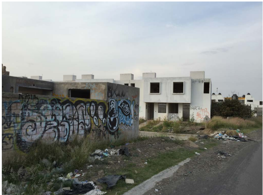
Figure 2. Slumification in sections of early 2000s mass social interest housing, Guadalajara, Caused by lack of demand and abandonment.

Critical issues of abandonment, physical deterioration, and urban marginalization are frequently seen in formal mass social interest housing estates across Latin America (Carvalho, 2015). This process of deterioration has been documented in social interest housing estates developed by the Institute of the National Fund for Workers' Housing (Instituto del Fondo Nacional de la Vivienda para los Trabajadores, INFONAVIT) in Mexico, where residents report issues with the poor architecture and construction, the lack of regular provision of