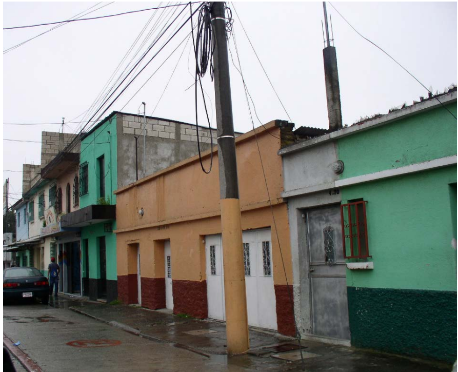
Figure 5. Colonia La Florida, innerburb consolidated settlement with large lots on a reticular plan of blocks and streets, Guatemala City. (Photo courtesy Dr. Peter Ward).

Republic is an example of an informal settlement that was first created on state land in the late 1980s and early 1990s (see Figure 10(a) & Figure 10(b) below): indeed, the land was formerly a city landfill and as are many other informal settlements, portions are prone to flooding and landslides (Pusch, 2010: p. 32). In such cases, the residents have very little security in terms of land tenure and are less likely to improve their dwellings or pay for services. Where residents are able to gain legal title to the land through regularization, flooding and other issues such as erosion may make it very hard to substantially improve the infrastructure and consolidate over time. In the case of such settlements, not only do the residents struggle to make improvements but the state and local government may also limit consolidation efforts by refusing to recognize them and provide services.