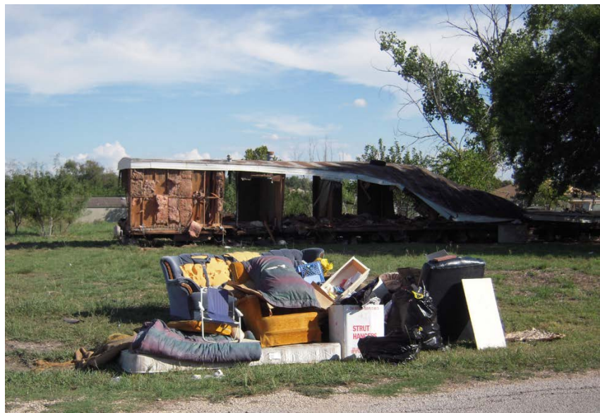
Figure 8. Post tropical-storm abandonment. Rancho Vista informal settlement, Guadalupe County, Central Texas.

La Perla in Old San Juan, Puerto Rico, has struggled in the face of natural disasters due to its location on the coast ( Figure 9 ). The 100-year-old settlement has housing in all types of conditions built from various materials and techniques. As Caldieron explains, “La Perla demonstrates many signs of urban decay and poverty, even though this neighborhood is located on one of the city’s most valuable pieces of land” (Caldieron, 2013: p. 55). 8 La Perla was particularly