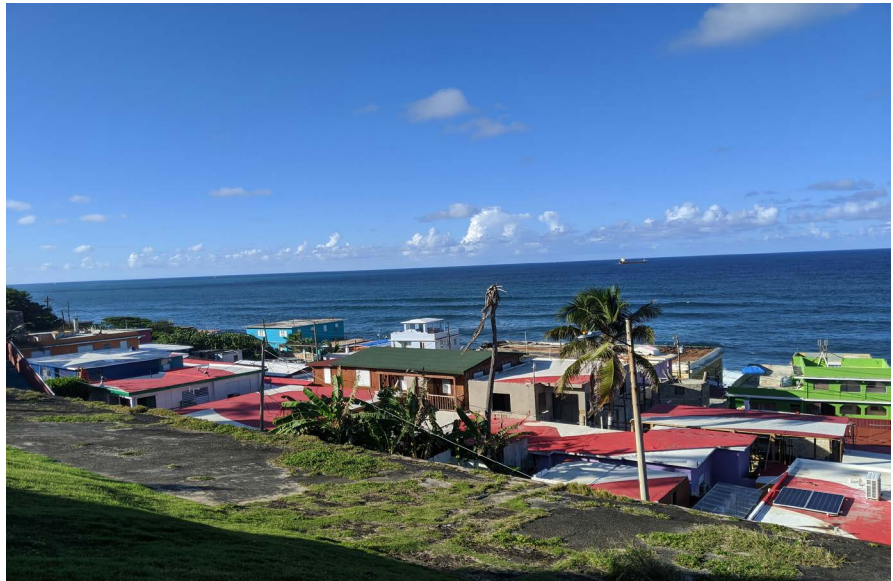
Figure 9. Due to its position close to the coast La Perla is more susceptible to damage from hurricanes. Additionally, La Perla technically rests just outside the boundary of Old San Juan which creates an additional bureaucratic layer of precariousness. (Photo courtesy of Holly Buttrey).

affected by Hurricane Maria. Residents lost access to water and electricity, similar to other communities in the island (Begnaud, 2017). La Perla's consolidation, however, is on more precarious footing at the hands of environmental disaster due to its physical location. In some cases, efforts at consolidation in La Perla have been lost to hurricanes and residents have to spend additional cost on improving their housing quality and rebuilding. This is a clear example where natural hazards have caused massive deterioration of an informal settlement with limited ways to improve conditions even though it abuts the relatively wealthy neighborhood of Old San Juan.