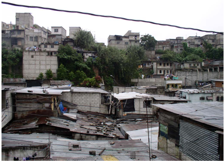
Figure 3. Inner-city consolidated shanties, El Esfuerzo, Guatemala City. (Photo courtesy Dr. Peter Ward).