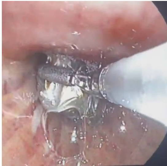
Figure 2. Biopsy forceps attempting to dislodge foreign body.