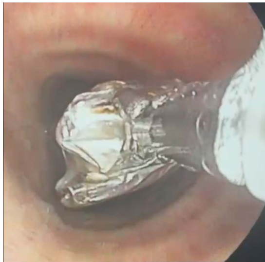
Figure 3. Withdrawal of bronchoscope together with foreign body.