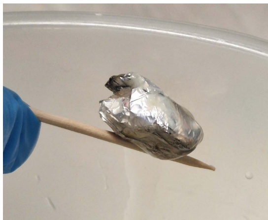
Figure 4. Package following retrieval.