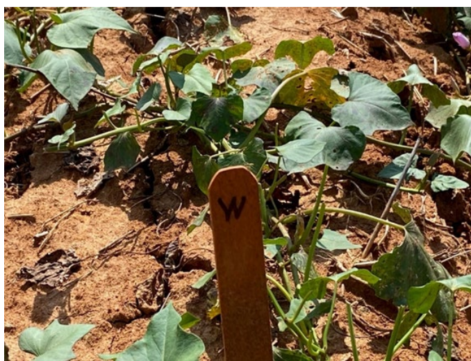
Figure 2. Early shedding, 57 days after planting on Sep 16, 2022; soil surface breakage was also shown.

Figure 3 shows the fallen leaves (decayed away) during the thirteenth week. Although the fallen leaves are gone, their previous existence can be figured out: the brownish leaf leach color, leaf print on the soil surface, the bare old vines (used to be equipped with full leaves).