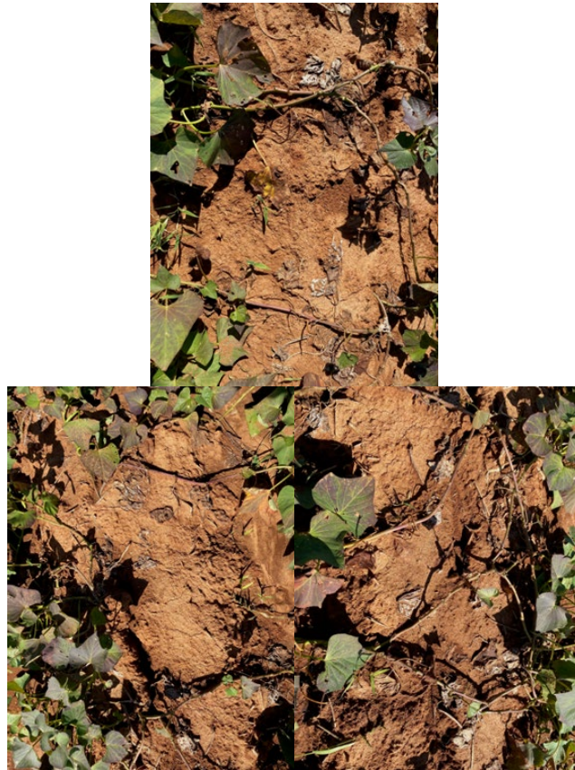
Figure 3. Showed leaf shedding imaged on the 86th day after transplanting on October 14, 2022. The bare soil surfaces without shading under the Sun at this season are a miracle, as such surfaces are usually covered by weeds.

The estimated fallen leaf dry matter over a growing season was 1.2 - 2.8 t/ha, taking the average as 2 t/ha, assuming the growth season as 17 weeks (119 days), leaf shedding from the fourth week to the thirteenth week almost accounts for 0.390 (from curve N = 1.50 - 2.75t + 0.72t^2 ) of the total leaf shedding for the whole season, i.e. , 0.78 t/ha, equivalent to 78 g dry matter/m 2 .