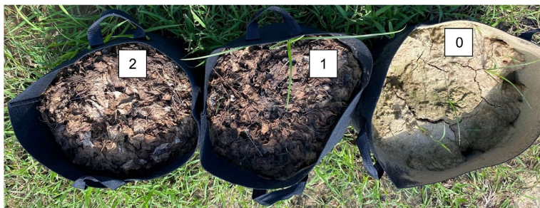
Figure 4. The top image was taken on July 16, 2025, and the bottom image on August 4, 2025. The pots were filled with field soil, each assumed to contain a similar weed seed bank. They were numbered 0, 1, and 2 from right to left and placed in the field to receive daily dew and natural precipitation. Although no main crop was planted, the emerging plants are referred to as weeds in this context.