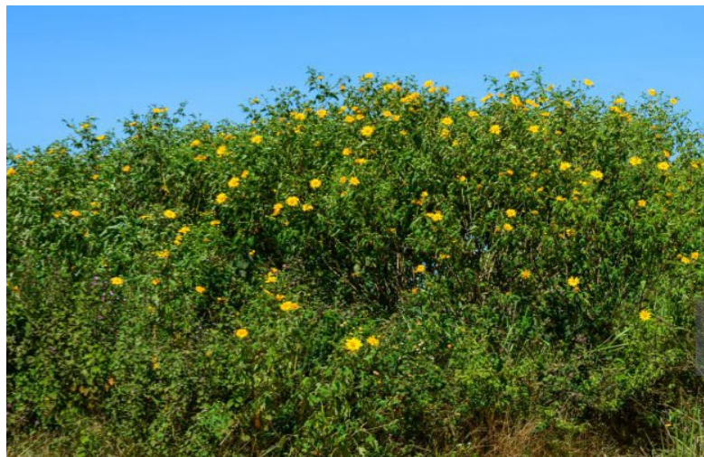
Figure 2. Mature Thitonia diversifolia plants.

Statistical analysis of the data was performed using Statistix 8.0 software. To compare the means of the different treatments, the analysis of variance (ANOVA), supplemented by the LSD test at the probability level of P \leq 0.05 was used to identify the treatment(s) that differ significantly from the others.