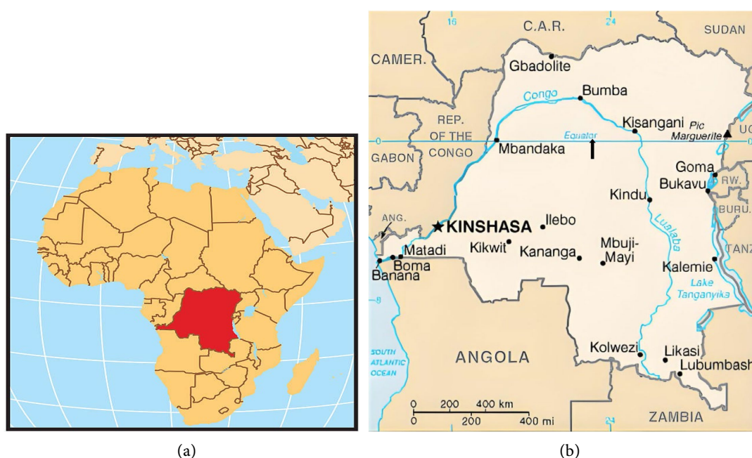
Figure 1. Location of experimental sites (a) Democratic Republic of Congo (red) on a map of Africa; (b) Details on the map of Democratic Republic of Congo. The arrow indicates the site (Mbuji Mayi) where the study was conducted. Adapted from Google Map, accessed in June 2023.

Ot: Total Organic Carbon; Nt: Total nitrogen; CN: Carbon-to-Nitrogen Ratio, P: phosphorus, K: potassium, CA: calcium, Mg: Magnesium.