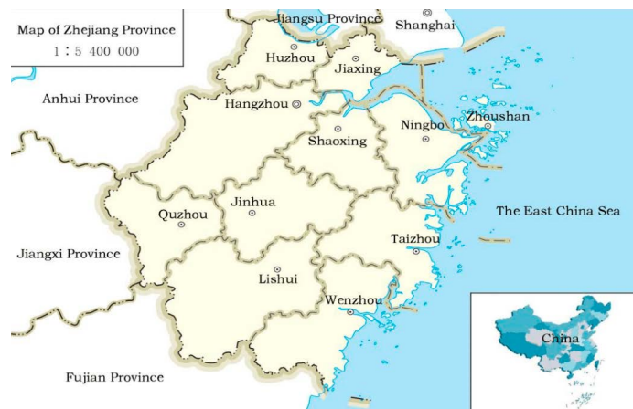
Figure 2. The hinterland economic of Ningbo-Zhoushan Port.

Port hinterland refers to the area where cargo and passengers are collected and dispersed in the port, and it is also the area where the port economic development can drive and radiate the surrounding economy. The port economic hinterland includes direct hinterland and indirect hinterland. Ningbo-Zhoushan Port has a broad direct economic hinterland due to its superior geographical advantage and economic strength. According to the official website of Ningbo-Zhoushan Port and the research results of predecessors, the direct economic hinterland of Ningbo-Zhoushan Port mainly includes Zhejiang Province (See Figure 2 ). From the perspective of economic aggregate, the GDP of Zhejiang Province in the hinterland of Ningbo-Zhoushan Port has a sustained and rapid growth trend, increasing from 616.479 billion yuan in 2000 to 771.536 billion yuan in 2022, with an average annual growth rate of 12.2%; From the perspective of industrial structure, the secondary industry increased from 328.71 billion yuan to 3320.52 billion yuan, with an average annual growth rate of nearly 11.1%. The industrial structure of Zhejiang Province has been continuously optimized (This section date: Zhejiang Statistics Yearbook).