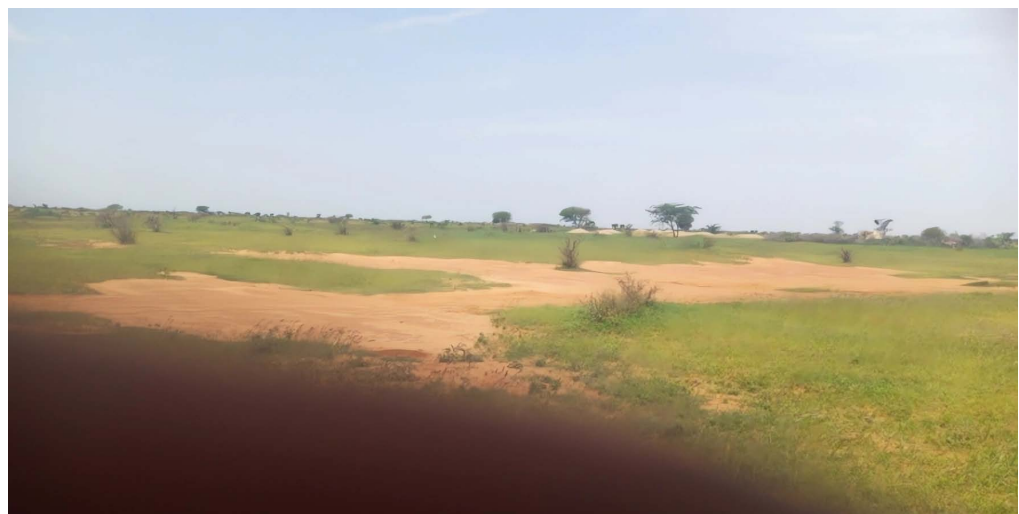
Figure 3. Natural vegetation in north Kordofan state.