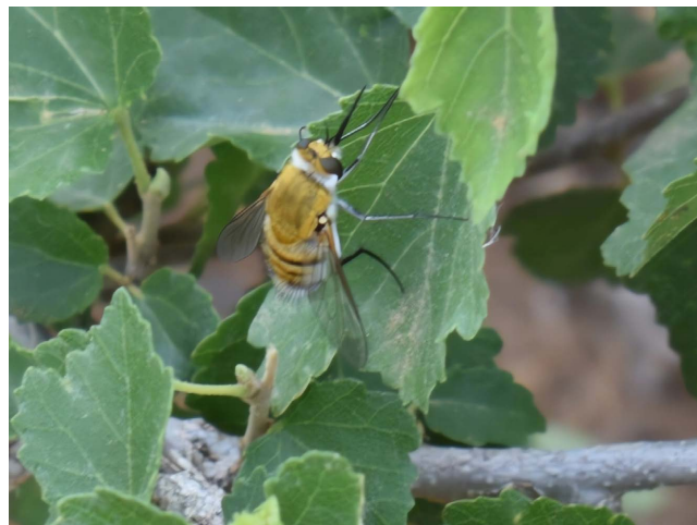
Figure 4. Bee fly, Eurycareus dichopticus.