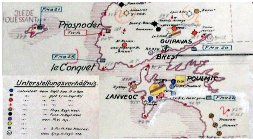
Figure 1. German air-naval base of Lanveoc-Poulmic.

veoc-Poulmic were built belonged to the Barons de Poulmic family, whose known origins dated back to the 12 th century and which died out during the French Revolution. The base took up the family's weapons to create its ensign.