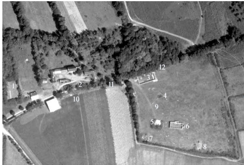
Figure 3. Bro Fez base layout—1 rectangular emplacement; 2 farm; 3 bunker; 4 construction; 5 emplacement; 6 bunker; 7 Vf bunker; 8 Vf bunker; 9 water pit; 10 transformer; 11 base portal; 12 hygienic services.

ponents were the following (Figures 3-5):