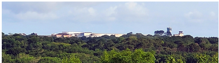
Figure 2. Air-naval base of Lanveoc-Poulmic—vision from Bro Fez, on the right the modern control tower (higher) and the older control tower (lower).

After numerous and devastating bombings, the base was captured by the Allies on 17 th September 1944 and the LV (vessel lieutenant) Le Hénaff took possession of it on behalf of the French Navy. The base was rearmed on 21 st December 1944 (Figure 2) under the commandment of CF F. Bergot.