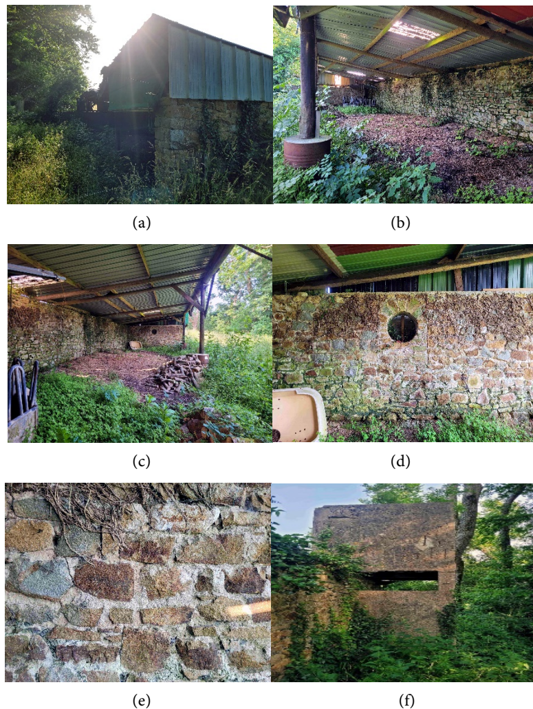
Figure 5. Bro Fez base details—(a) rectangular bunker 3 with a blue metallic coverage; (b) internal vision to the East; (c) internal vision to the West; (d) West wall portion with circular opening; (e) local wall stones; (f) elevated cistern of the hygienic services.

A rectangular emplacement 1 ( 48^{\circ}15'22.66''\text{N} , 4^{\circ}25'39.66''\text{W} , h. 58.33 m) disappeared.