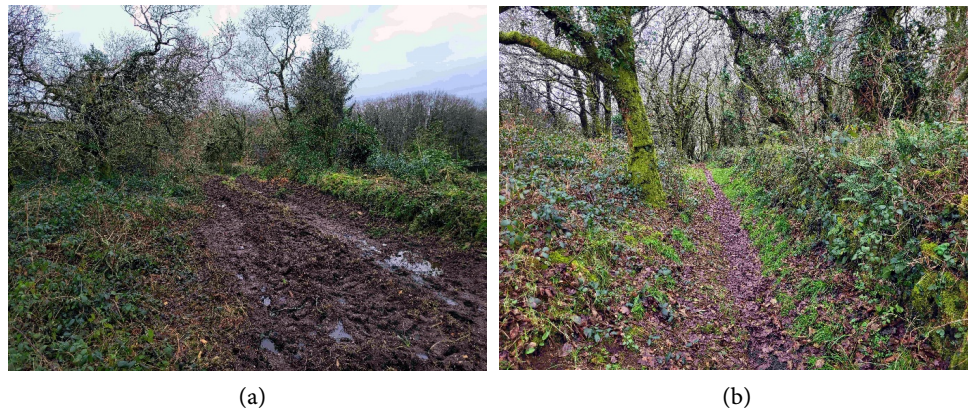
Figure 4. Tromenie trail (6)—(a) near the Grille component (12) on the left; (b) near the component (14) on the left.