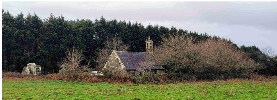
Figure 5. Ar Zonj chapel enclosure—on the left entrance with the stone pulpit and Celtic cross pillar, in the middle the chapel rebuilt in 1977.

The emplacement of a 4 \times 4 m Freya radar bunker (12) ( 48^{\circ}05'55.67''\text{N} , 4^{\circ}10'48.21''\text{W} , h. 279.71 m). Its walls and its protection wall covering its south-east entrance were completely covered by vegetation, consequently their preservation state has not been established.